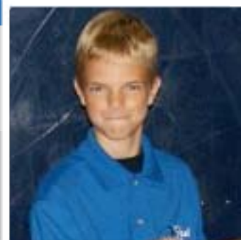
FESTIVAL WINDS CONCERT Sunday, February 22 4PM & 5PM